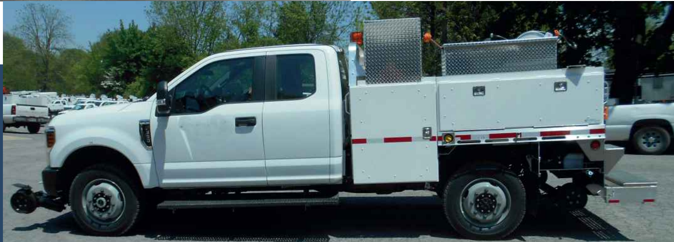
Track Inspector Trucks