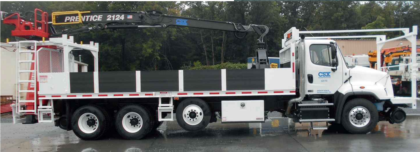
Material Handling Trucks